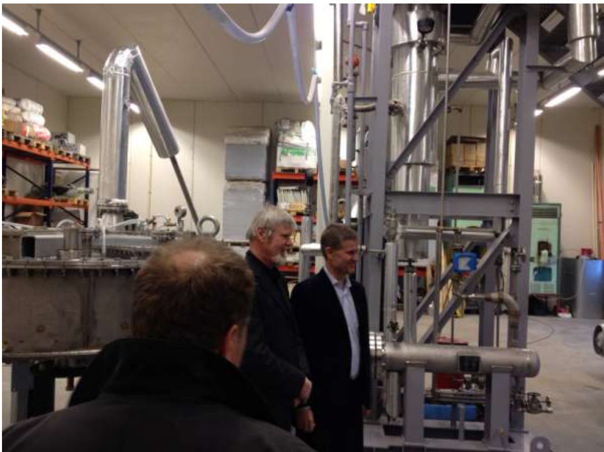
Norway's Environment Minister Erik Solheim (right) visits the MicroFuel prototype on 6 March 2012.