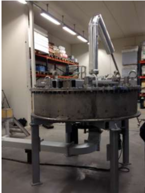
The MicroFuel reactor. This consists of a turntable in which woodchips are exposed to microwaves. This causes flash pyrolysis, leaving bio-char, with the resulting gases condensed to harvest bio-oil.