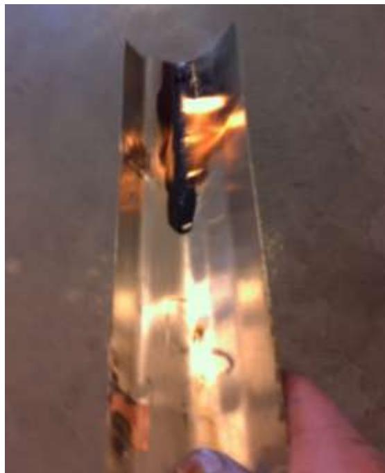
Bio-oil collected from the pyrolysis process (left). It can ignite, confirming its potential as a fuel (right).