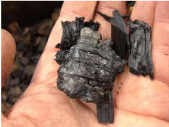
Bio-char produced in the prototype plant. The waste wood has been fully pyrolysed, leaving light carbonized chips